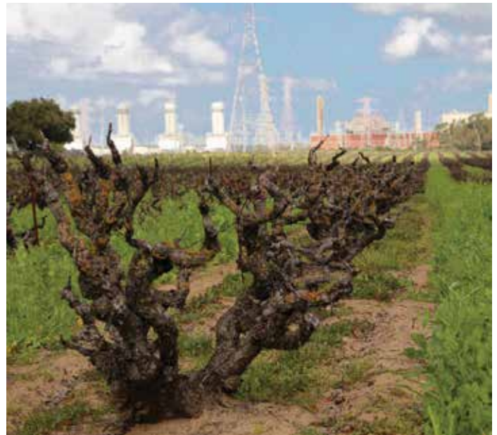
100+ year old Mourvedre vines in Oakley, holding their own vs. factories and power lines!

on to the final Building Permit before the end of this year. At that point, the weather plays a part on whether we can break ground, grade the site and pour the foundation. We need the rain for many reasons here, but it will slow down our construction! Our total plan is to build a 50,000 sq ft winery with a beautiful new tasting room and patio, plus (hopefully) a full restaurant, all to be built in the middle of the “Windsor Beverage District,” which is full of other wineries, breweries, a cidery, and even a distillery, and a stone’s throw from the new $50 million facility of Russian River Brewing. I will be able to bring all of my wine production into one space at long last, and offer all of you a fantastic hospitality center. It will be wonderful to return to Windsor, because I developed much of my winemaking skills during almost 20 years at Windsor Vineyards. Our target date for completion is late 2021/early 2022...we will keep you posted as things progress!