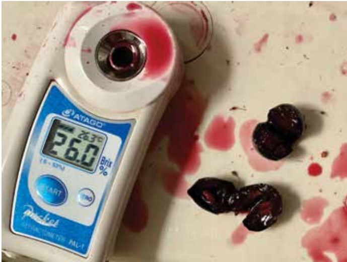
Hand-held digital refractometer is a critical tool to measure sugar in grapes as they ripen—these are purple-juiced Alicante grapes